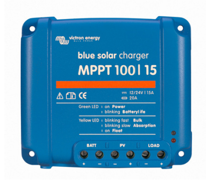
Solar charge controller MPPT 100/15